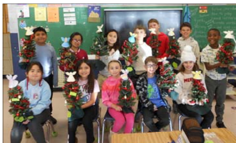
Picture: Grade 3 students holding the Christmas trees which contain the activities they did for Advent.

26th. It is the beginning of the preparation for First Holy Communion. Please keep these students in your prayers.